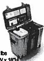
Weights 48 lbs 19"L x 12"W x 18"H Power: 110v 15amps